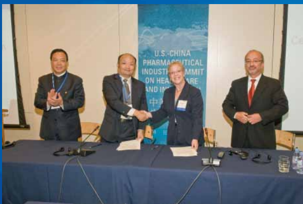
SINO-PhIRDA and PhRMA signed MOU

On November 18, 2010, “The Second Sino-U.S. Pharmaceutical Industry Summit”, co-hosted by SINO-PhIRDA, PhRMA and U.S. Chamber of Commerce, grandly opened at Ritz-Carlton Hotel in Washington in U.S. This is also the first attempt for China's powerful pharmaceutical companies to do a face-to-face communication with America—a powerful country in pharmaceutical industry. More than 100 representatives from pharmaceutical companies in China and U.S., U.S. government, China's Embassy in U.S. attended the forum. Vice Chairman of Standing Committee of 11th National People's Congress, SangGuowei delivered an important video speech in this meeting. He pointed out that this summit is the continuance of “China Reform of Medical and Health System” held in Changsha in 2009, which is an important event in pharmaceutical industry for SINO-U.S., and it will also expand the channels for the communication between China and U.S.