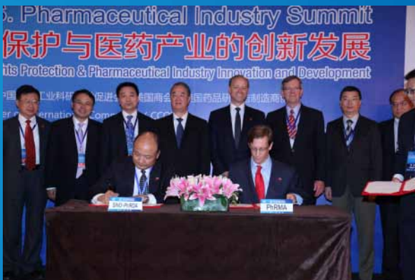
SINO-PhIRDA and PhRMA signed the Joint-Statement of Intellectual Property Protection