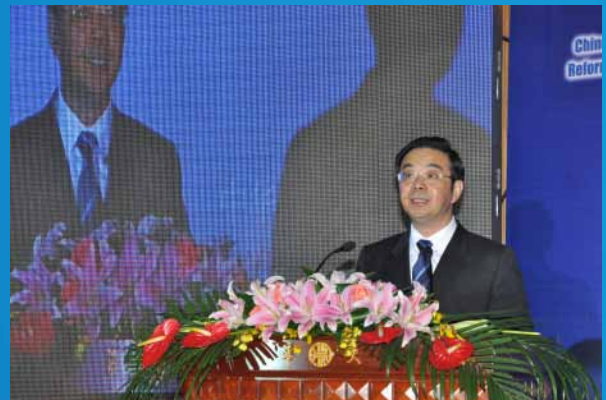
Welcome address by Hunan Provincial Governor ZHOU Qiang (Then)